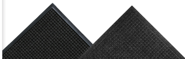
Fashion Fabric Border